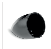
Tilted mounting frame: Easy to install