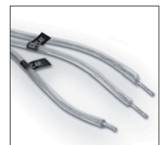
Mounting options: car and display